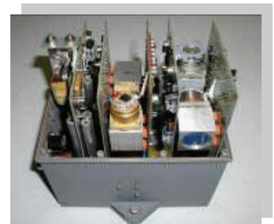
Rate Sensor Unit F-16 Heads Up Display