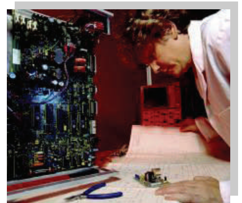
Technical Documentation Services