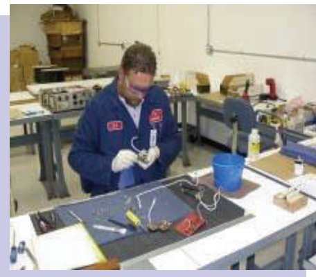
Test, Teardown and Evaluation