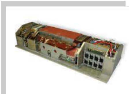
Rantec Power Supply ALQ-184

Power Supplies, RF and Microwave Transmitters and Receivers, Frequency Synthesizers and Multipliers, Pulse Forming Networks, RBDT's, TWT's, Transformers, Rectifiers, Low Noise and Power Amplifiers, Pulse Shaping and Trigger Amplifiers, Demodulators, YIG Oscillators, Waveguides, Scanners, Discriminators, Converters