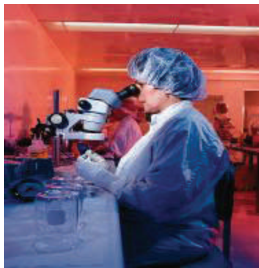
Clean Room Assembly