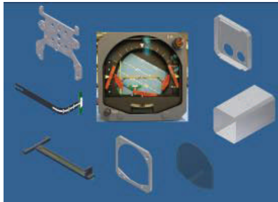
Reverse Engineering and New Build (e.g. Flight Directional Indicator)