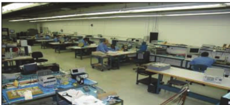
Large Work Bays