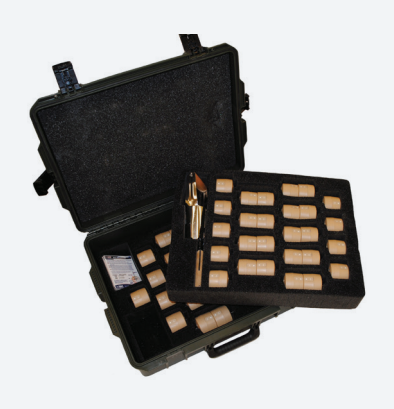
Choose your sensor quantity

Military grade E-UGS is subject to International Traffic and Arms Regulations (ITAR), requiring a U.S. Department of State license to export. The E-UGS 2000 model is not subject to ITAR.