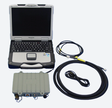
Available as a standalone system or installed on your computers

Over 40,000 first generation E-UGS sensors have been delivered to the U.S. forces. Recently incorporated is a "slew to cue" capability allowing high power day/night cameras to monitor activity alerted by the sensors automatically. E-UGS 2000 sensors have been recently deployed along the U.S. Mexico border as well as at storage facilities in the Southwest.