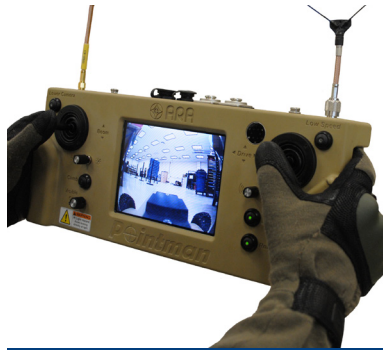
Fast to deploy. Minimal training.